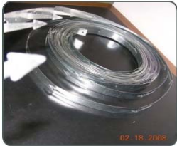
Insul-hold coils come in 100' Rolls

Insul-Hold is a support system for all types of rigid and fiberglass insulation products. Designed to anchor and hold most types of insulation in the correct position thereby preserving the R-value of the insulating product. Whether used to prevent heat loss or promote efficient cooling, Insul-Hold assures maximum effectiveness of any insulating product. Insul-Hold also doubles as horizontal bracing which prevents insulation from falling too deeply into the wall cavity. Suitable for use in wood frame, steel building, or masonry construction of interior or exterior walls, ceilings and crawl spaces and in basements, it provides support even where sheathing is not required. Insul-Hold is ideal for use in retrofitting buildings as well as new construction to Green and LEED standards. Easy to use Insul-Hold saves time, energy and money.